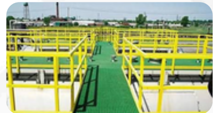
GRATINGS AND CABLE TRAYS