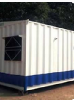
FRP SITE CABIN & STORAGE UNIT