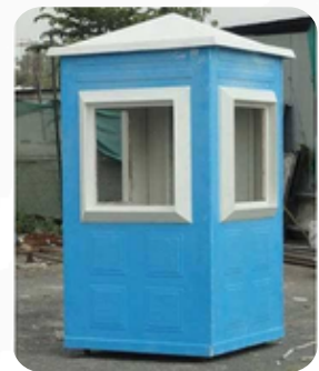
FRP SECURITY CABINS