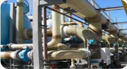
INDUSTRIAL PIPING SYSTEMS AND FITTINGS

We offer a comprehensive range of non-metallic industrial equipment and prefab solutions.