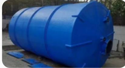
STORAGE TANKS AND VESSELS