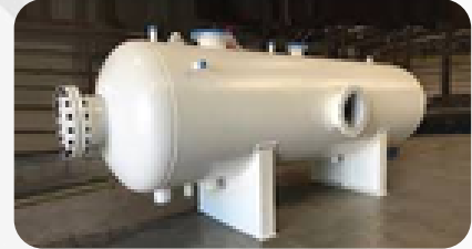
PROCESS EQUIPMENT AND REACTORS