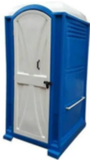
FRP MODULAR TOILET & URINAL BLOCK